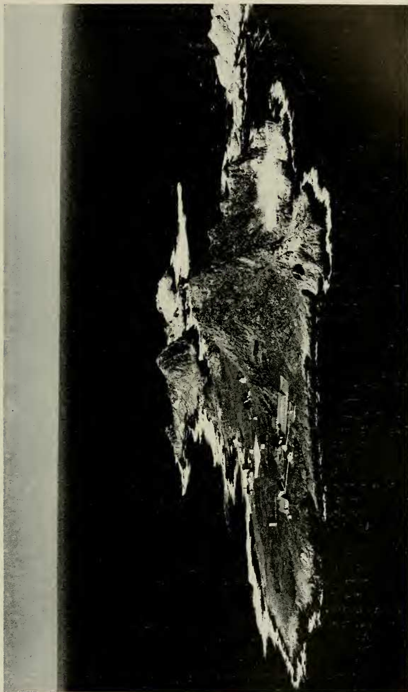
Southeast Farallon Island showing the terrace upon which the lighthouse maintenance buildings are placed and in the foreground, sea caves made during a former submergence. The highly weathered and fractured nature of the diorite is visible in the original print. The camera was pointed westerly.